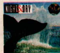
ON THE COVER:

25 CLASSICAL MUSIC Pioneering new music ensemble Kronos Quartet's program at UCSD's Mandeville Auditorium tomorrow showcases the performers' many decades.